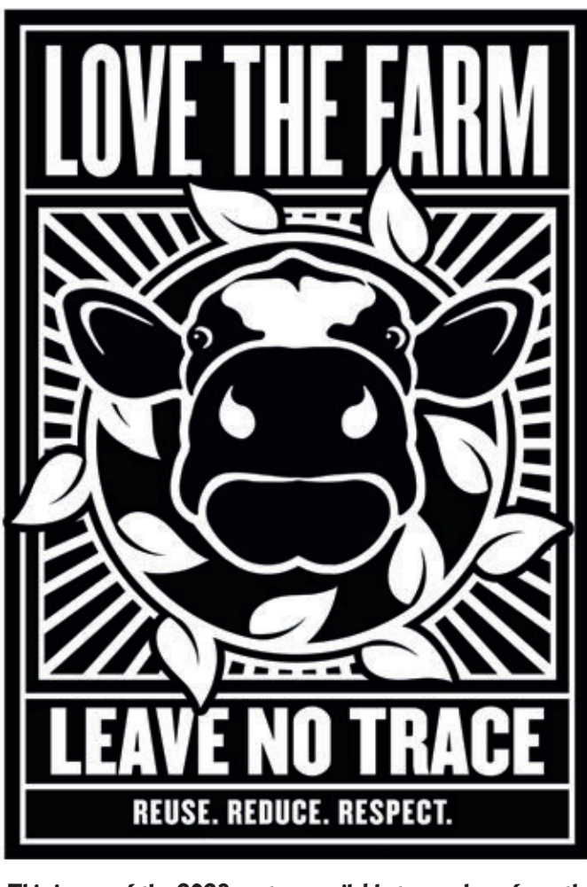
This is one of the 2023 posters available to purchase from the Glastonbury Free Press tent in the Theatre & Circus Field.

Of course you can. There's no dress code for my shows. Plus, you can use your litter picker as a selfie stick.